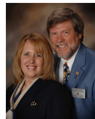
Rotary District 5890 Governor 2009-2010